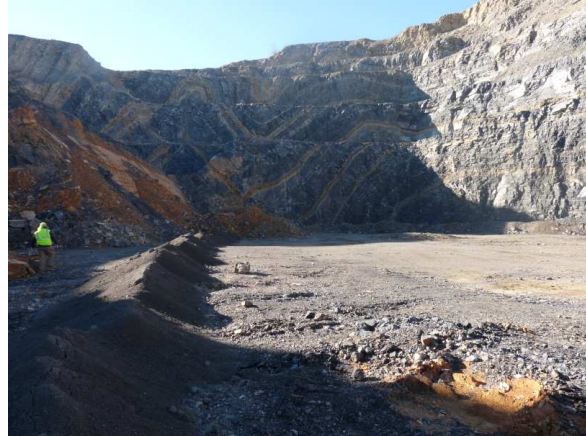
Bedrock quarry folded.