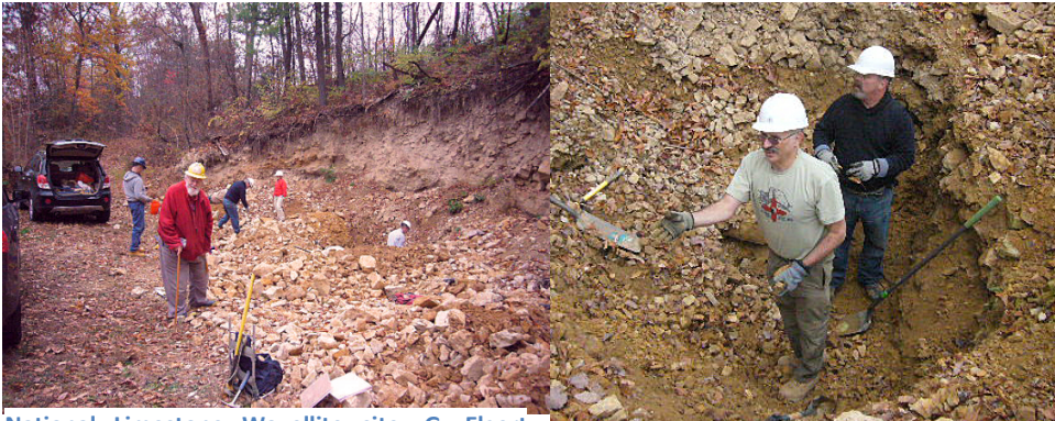
National Limestone Wavellite site. G. Elgert foreground.

Some rockhounds did venture into the quarry to collect some calcite crystals and some strontianite coatings.