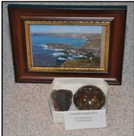
Holly McNeil's Tremolite Serpentine, Lizard Peninsula, Cornwall England