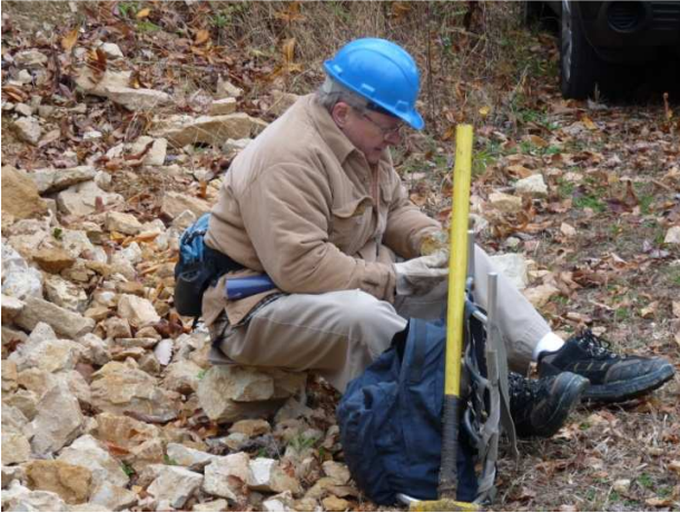
Studying the wavellite.