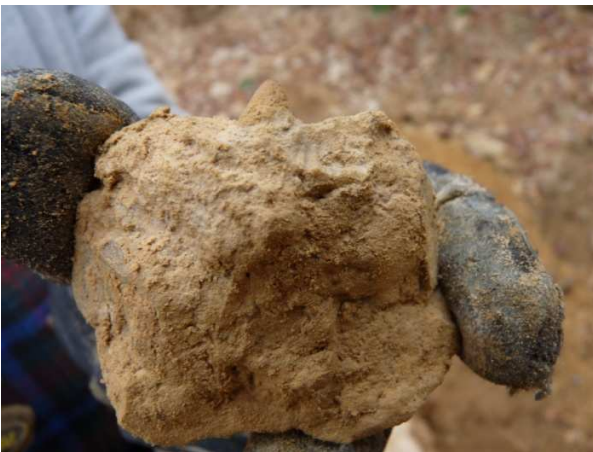
Keeper or Leaver? Only a good cleaning will tell.