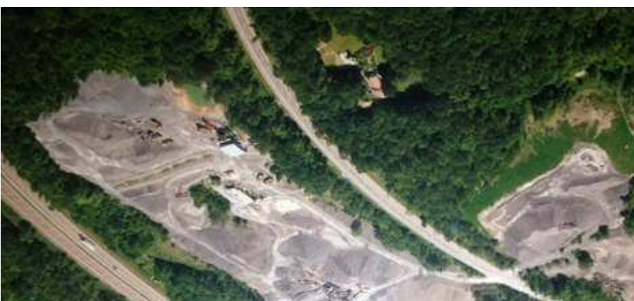
Bedrock Quarry. Flintstone, MD