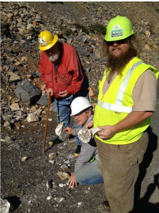
Bedrock collecting.